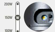
Selector switch allows choosing between 3 wattage levels