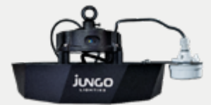
Motion and daylight sensor